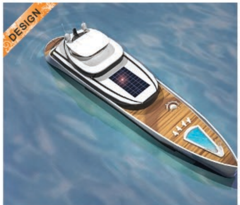
Blue Dream II redefines luxury using solar power

Get your designbuzz dose daily in your email, subscribe to our Daily Mail: