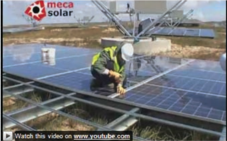
Watch this video on www.youtube.com MECASOLAR SolarPV Tracker More Easy to Transport and Install 2 Axis and 1 Axis Solar PV Trackers youtube.com/mecasolar