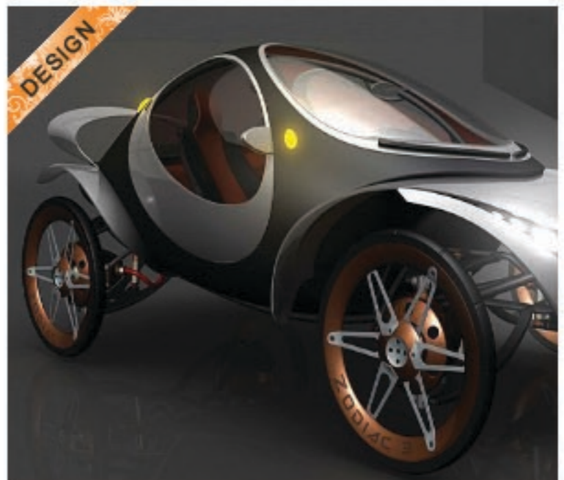
Ultra Light Electric Vehicle (ULEV) to weigh a quarter of what other electric vehicles do