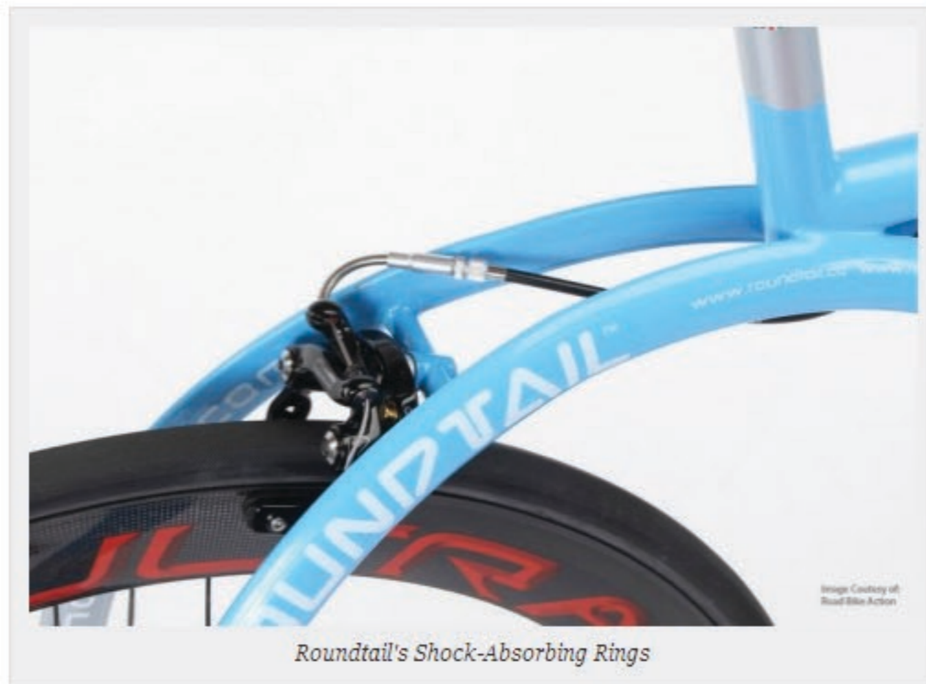
Roundtail's Shock-Absorbing Rings

Is it possible to improve upon the traditional diamond frame of a road bike without losing ground in efficiency? Avid cyclist, entrepreneur, and novelist, Lou Tortola, has given it a shot. After putting in over 3,000 miles on his bike last year and talking with his cycling friends in his age 50+ riding group who stopped riding or would shorten their rides due to discomfort or injuries, Mr. Tortola imagined a bicycle where the “straight to your bum” seat stay is replaced with shock-absorbing rings. The idea is to reduce road vibrations and impact to the rider’s spine. After coming up with a prototype and contacting bike builder, Paul Taylor , the Tortola Roundtail was built.